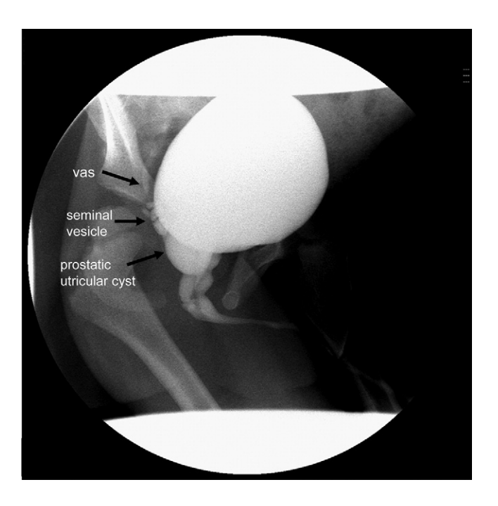
Figure 3. VCUG shows reflux of contrast material into PU cyst, right SV and right vas in case 1.

Patients with RV cysts are usually asymptomatic but some may present with conditions such as LUTS, urinary retention, epididymitis, hemospermia, pelvic pain, rectal mass and obstructive azoospermia. Development of symptoms appears to be determined by the relative size of the cyst; anatomical relation with pelvic organs; degree of obstruction of the bladder neck, SV or ejaculatory ducts; and presence of associated infection. In our series urinary retention developed in 2 patients with SV cysts. Although these cysts arise from the SV and are lateral in position, they can enlarge, expanding toward the midline, and consequently can obstruct the bladder neck.